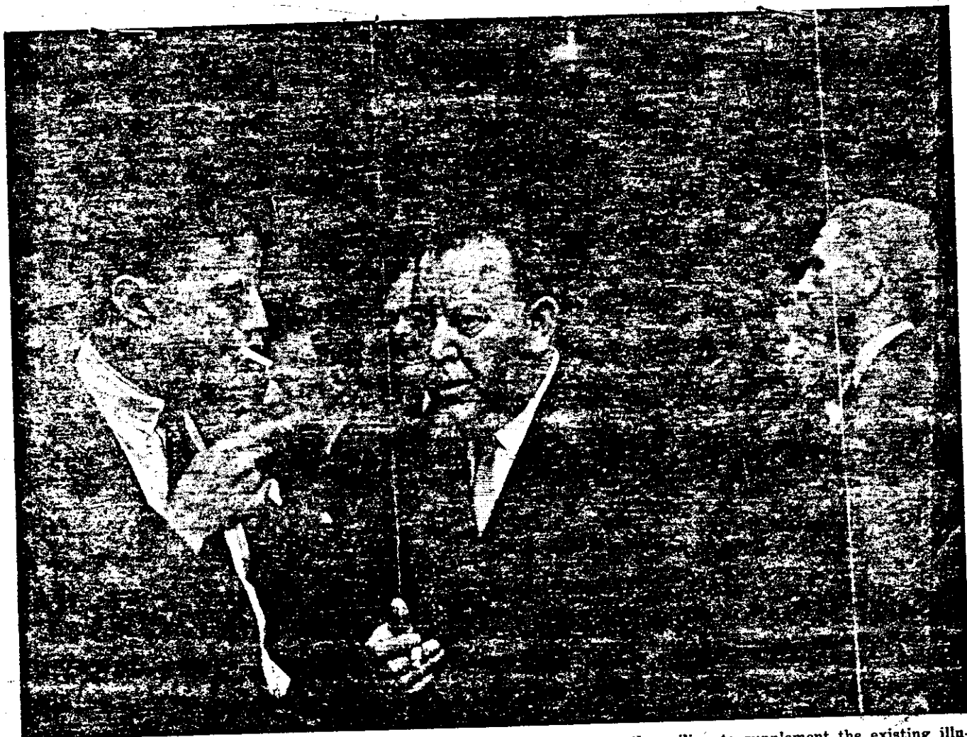
TRYGVE LIE, UN Secretary-General, is shown talking to reporters in an important session. One No. 6 flashbulb was

reflected from the ceiling to supplement the existing illumination. 1/100, at f/3.5.